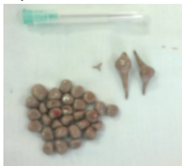
Fig.1 Multiple stones extracted via PCNL from a calyceal diverticulum.

Percutaneous nephrolithotomy (PCNL) is a minimally invasive technique used for large kidney stones (>20mm). Urinary sepsis and intra or postoperative bleeding are the very serious complications associated with this type of procedure. The indications for PCNL include staghorn calculi, ureteropelvic junction obstruction and calyceal diverticula (fig. 1), renal anomalies (horseshoe kidney), very hard stones (Hounsfield units \geq 1000 ).